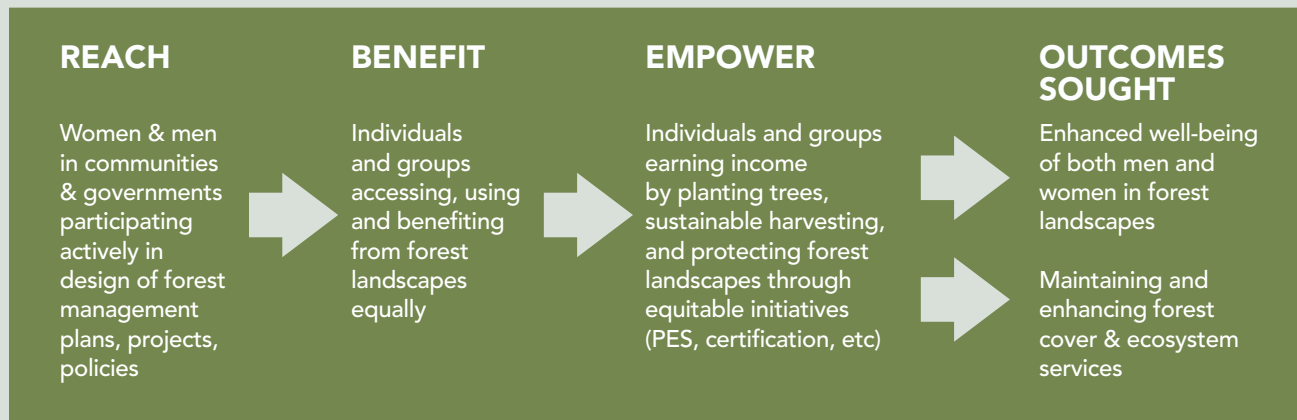
FIGURE 1: GENDER-RESPONSIVE OUTCOME PATHWAY